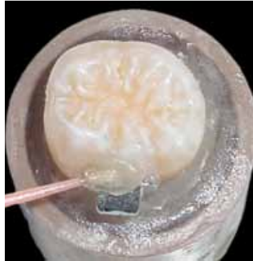
FIGURE 3 - Applying resin to occlusal surfaces of tube/tooth interface with aid of brush dipped in adhesive.