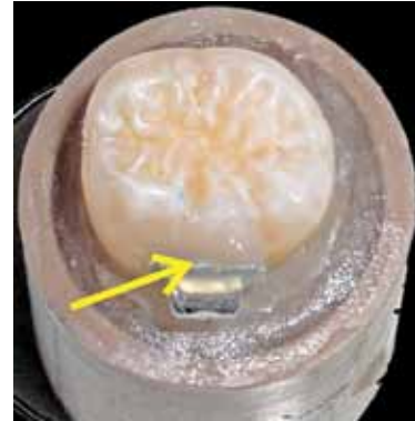
FIGURE 4 - Test specimens in Group 1: Conventional direct bonding followed by application of additional layer of resin to occlusal surfaces of the tube/tooth interface.

average time required for reinforcement application in Group 1.