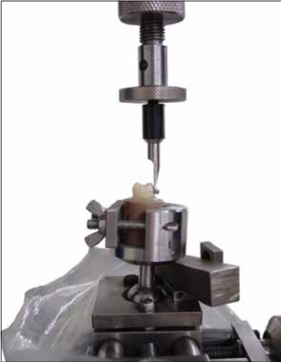
FIGURE 6 - Position of the shear bond strength testing device.

However, despite all these improvements, most orthodontists have for decades banded molar teeth instead of directly bonding orthodontic tubes. 7 There is evidence in the literature that bonded molar tubes show a higher incidence of clinical failures than accessories that are bonded in more anterior regions of the dental arch. 10,18 However, it is essential to note that posterior teeth are subjected to greater masticatory efforts 15 and the occurrence of a higher percentage of clinical failures in this region is therefore perfectly justifiable. It should also be emphasized that there are no clinical studies showing that the banding of molars is more effective than directly bonding to these teeth. In conducting a longitudinal study to clinically evaluate the periodontium of banded vs. bonded molars, Boyd and Baumrind 2 found that banded maxillary molars had a higher incidence of clinical failures than bonded maxillary molars whereas the reverse was true to lower molars.