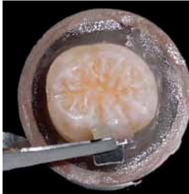
FIGURE 2 - Resin application to occlusal surface of tube/tooth interface in Group 1.