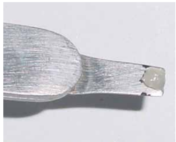
FIGURE 1 - Standardization of additional amount of resin applied to occlusal surfaces of tube/tooth interface in Group 1.

In Group 2 (Fig 5), after conventional direct bonding, 40 seconds were allowed to elapse before placing the curing light occlusally for another 10 seconds since total curing time in the experimental group was 30 seconds. This 40-second time was determined based on the