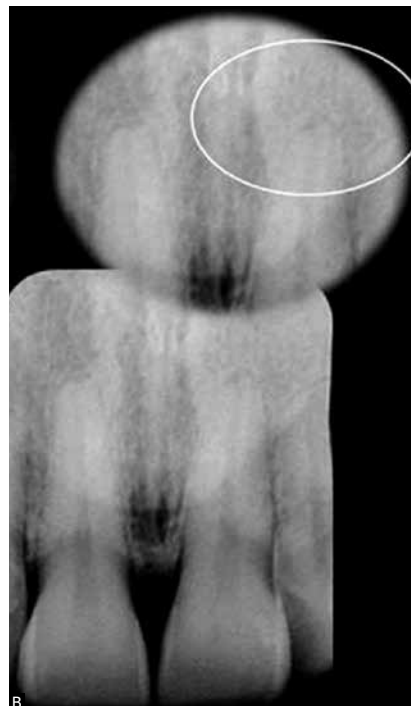
Figure 3 - CBCT scan of a maxillary left central incisor (A) (transverse view) shows more details of apical root resorption than periapical radiography (B).