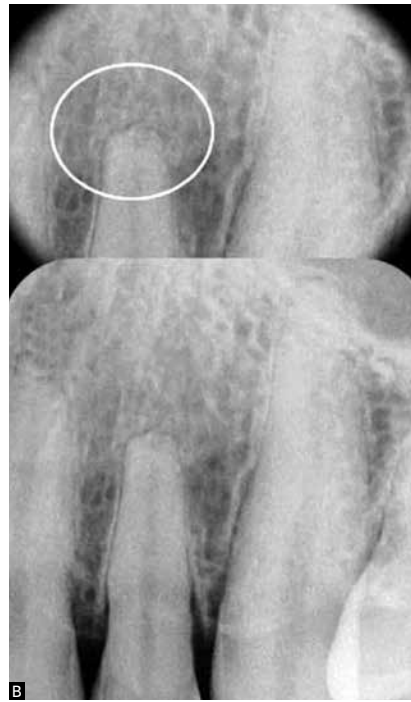
Figure 2 - Periapical radiographs of an upper left lateral incisor presenting the same ARR score after orthodontic treatment (A) and 288 months after treatment (B).