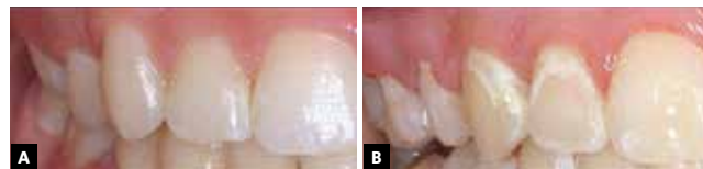
Figure 1 - Intraoral photographs of two patients after orthodontic treatment: A ) teeth with no white stain lesions, B ) teeth with white stain lesions.

In spite of the many advancements achieved by orthodontics over the last few years, decalcifications and white stain lesions continue to be frequent problems in orthodontic dental offices. The growing trend to replace banding of teeth by bonding associated with the use of fluoride-releasing bonding materials has certainly reduced the appearance of these lesions, however, there is still a great deal to be done. While giving some thought to this problem, researchers at the Universities of Jordan and Virginia in the USA 3 decided to verify, by means of questions put to patients and their parents, orthodontists and general clinicians, about who would be the responsible for the appearance of white stains, what would be the methods to prevent them, and who should treat them. All the groups evaluated were unanimous that white stain lesions depreciate the orthodontic patient's general appearance,