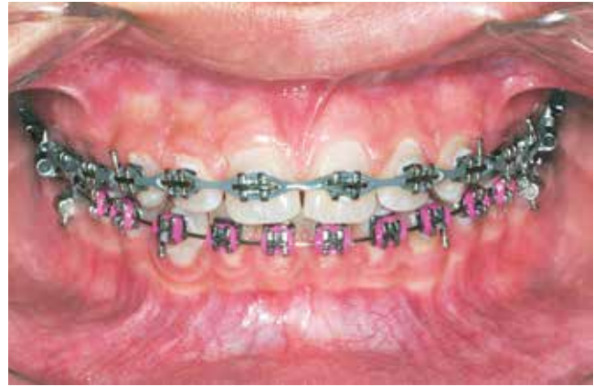
Figure 4 - Effect of crown mesialization induced by elastomeric chain.

Diastema relapse is quite often on maxillary anterior area. 10,24,26,27 Some authors reported that space reopening might be associated with an inappropriate root positioning at the end of treatment. However our results showed no difference between stable and unstable groups in central and lateral incisor angulations when compared in each initial, final, post-retention stages. In conclusion, this demonstrates that no association between space reopening and mesiodistal angulations was found.