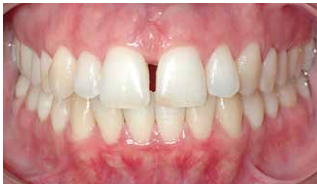
Figure 1 - Example of anterior superior diastema relapse. Photograph obtained 10 years after removing the superior Hawley retainer.

Ninety panoramic radiographs of 30 subjects (13 male and 17 female) taken at pre-treatment ( T_1 ), post-treatment ( T_2 ) and post-retention ( T_3 ) stages