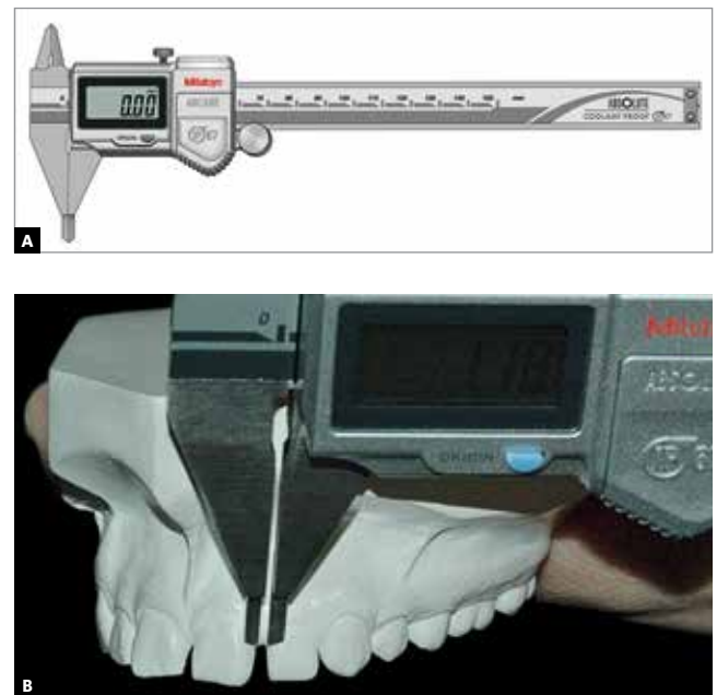
Figure 2 - A) Digital caliper Mitutoyo used to measure interincisor spacing. B) Diastema measurement method.

In this study, the IZP line was used because only twenty patients presented both orbital inferior contours in the panoramic radiographs of the initial, final and follow-up stages. The angle IO.IZP between the IO and the IZP reference lines was evaluated in