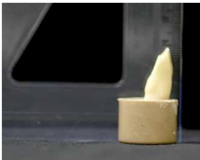
Figure 1 - Photograph of specimen showing vestibular face perpendicular to the ground.