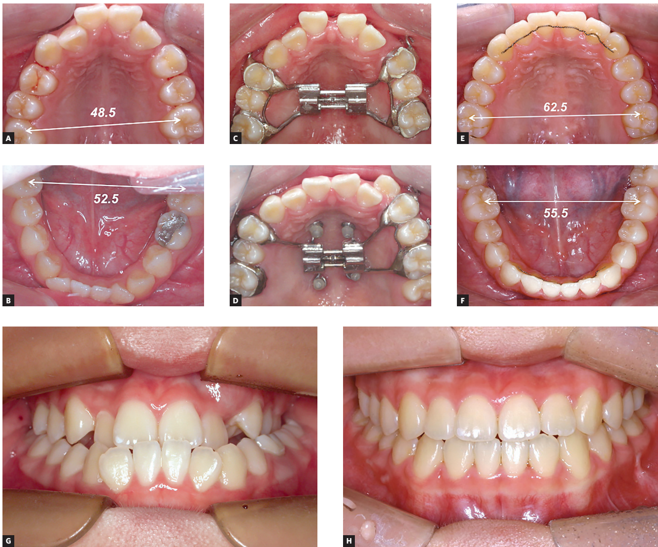
Figure 2 - An adolescent case (12 year-old female) with rapid palatal expansion (RPE) followed by MARPE to secure arch expansion. To resolve space deficiency and transverse problem (A, B), a repeated expansion (firstly with conventional [C] and secondly with MARPE [D]) was performed due to the relapse during treatment. Following the occlusal settling, a total of 14.0mm expansion in the maxilla was gained, compared to the minimal growth change in the mandible (E, F). A significant change in the occlusion is demonstrated: before (G) and after (H) treatment, without surgical intervention.