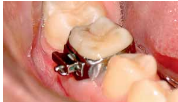
FIGURE 6 - Tooth 47 in upright position after 3 months of treatment.