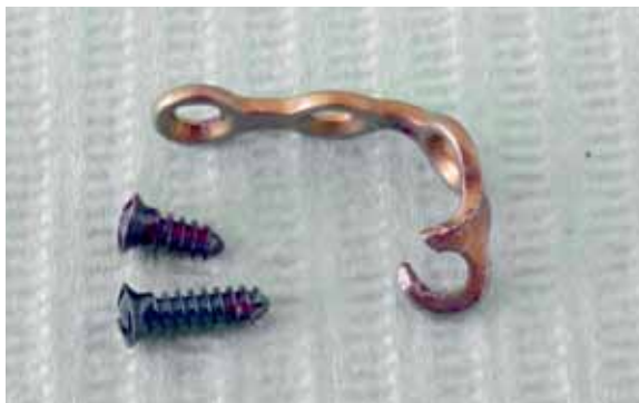
FIGURE 7 - Miniplate and screws surgically removed after 3-months treatment.