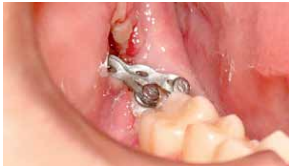
FIGURE 5 - Elastic chain for traction placed from the end of the miniplate to two orthodontic devices bonded to tooth 47.