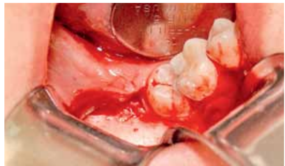
FIGURE 2 - Surgical exposure of the retromolar region/mandibular ramus for miniplate fixation.

The end of the miniplate to be used for orthodontic anchorage was exposed in the oral cavity. Immediately after the surgery, an orthodontic device was placed on the distal face of tooth 47 and