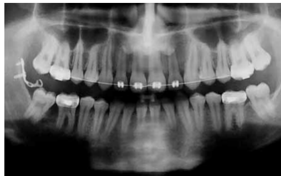
FIGURE 8 - Panoramic radiograph shows tooth 47 in correct position after 3-months treatment.