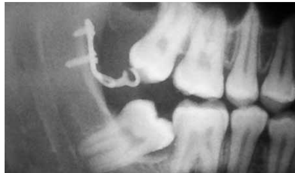
FIGURE 4 - Radiograph obtained immediately after miniplate fixation and before orthodontic movement was initiated.