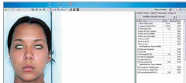
Figure 3 - Frontal photograph of a patient inserted into the Radiocef Studio 2 program (Facial Analysis configuration).

With these results we can conclude that with a Kappa index of 76.5% (high level of agreement), cephalometric and photometric methods for determining facial types are equivalent.