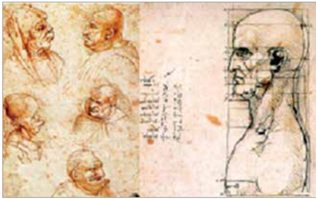
Figure 1 - Drawings of facial features described by da Vinci in the fifteenth century.

observe normal facial lines, taking into consideration the norm, straight profile like that of Apollo Belvedere.