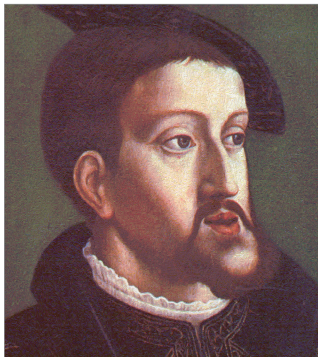
Figure 1 - Profile view of Carlos V of Spain and Germany at 17 years of age. His family included 13 lineages of European royalty and 409 documented individuals, 33 with 321 with mandibular prognathism varying from mild to severe. Analyses of this family suggested that mandibular prognathism has an autosomal dominant mode of inheritance, and cases that did not fit well may be due to consanguinity. In some cases, the prognathism escaped a generation and penetrance was estimated at 0.88.

Knowing that malocclusion is influenced by more than one gene and that these cases are clinically heterogeneous, it was first proposed to approach the question by studying clinically well-characterized cases 18 . Profile photos were obtained from all study participants, showing soft tissue relationships (concave or convex) and cephalometric measurements,