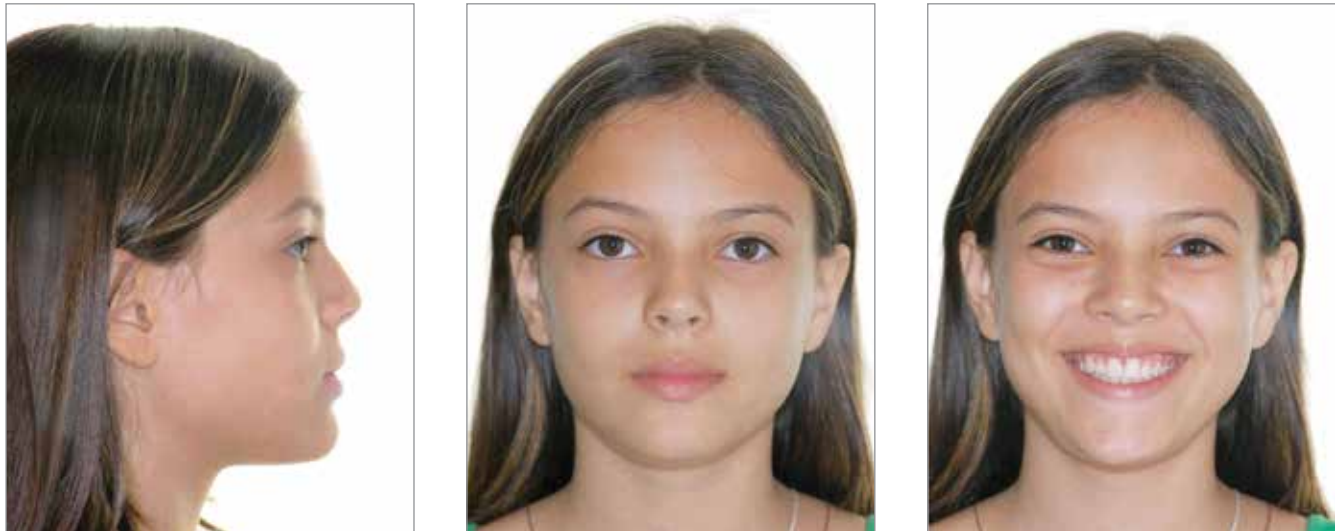
Figure 1 - Extraoral photographs of young Japanese-Brazilian female.