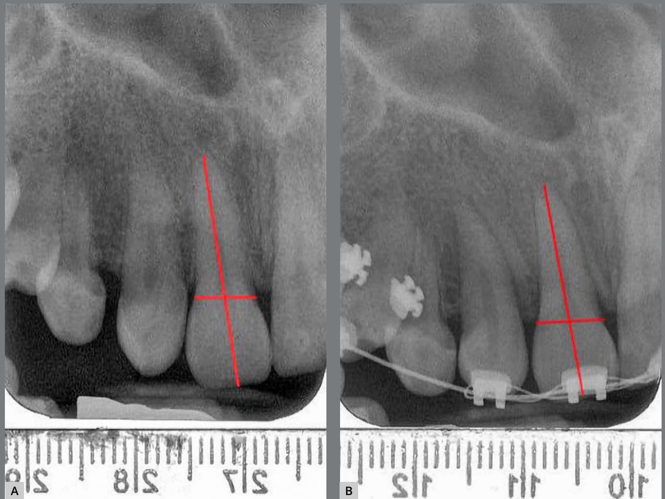
Figure 1: Evaluation of EARR: A) Point selection on an incisor, at the treatment onset; B) Point selection on the same tooth, at the end of fixed orthodontic treatment.

To standardize the parallel periapical radiographs, a correction factor was calculated based on the assumption that the crown length had to remain unchanged. Therefore, the ratio C_1/C_2 (pre-treatment crown length [ C_1 ]/post-treatment crown length [ C_2 ]) could determine the inconsistency between crown lengths of the two X-rays, and was used to compensate for the enlargement factor. Apical root resorption was then calculated as follows: