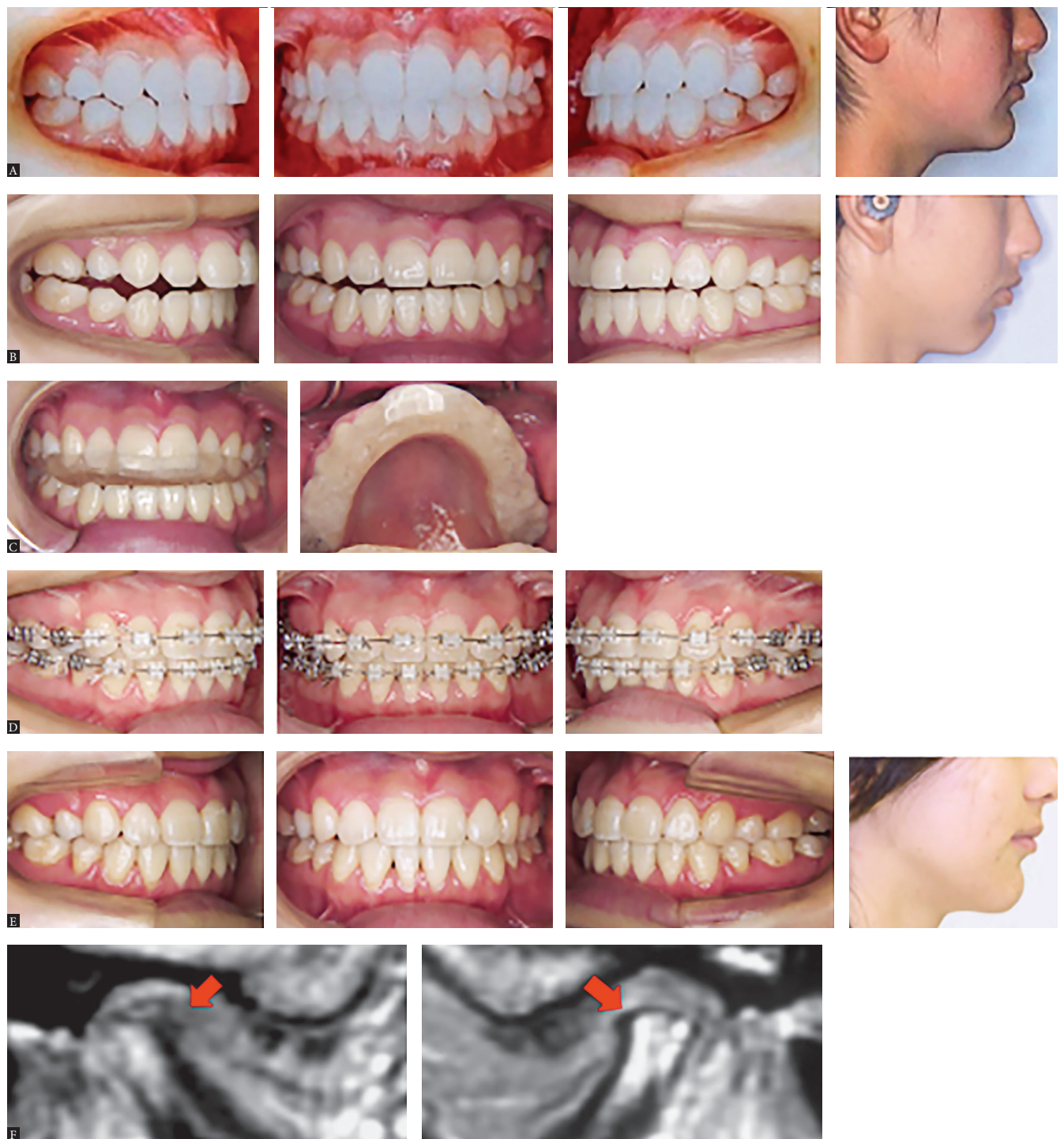
Figure 2 - A treatment case with open bite accompanied by osteoarthritis of the temporomandibular joint. A) Initiation of retention at a previous hospital. B) Initial arrival at our hospital. C) Initiation of splint therapy. D) Orthodontic treatment with multi-bracket appliances. E) Removal of all appliances. F) MRI indicated TMJ-osteoarthritis on both sides at initial arrival (Source: Tanimoto 2 , 2011).