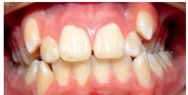
Figure 1 - Intraoral view of a patient with upper anterior crowding.

Orthodontic therapy for patients with upper anterior crowding from Group A was carried out by the use of self-tapping 1,6 x 10mm titanium mini-implants from SIN (Sistema de Implante, São Paulo, Brazil).