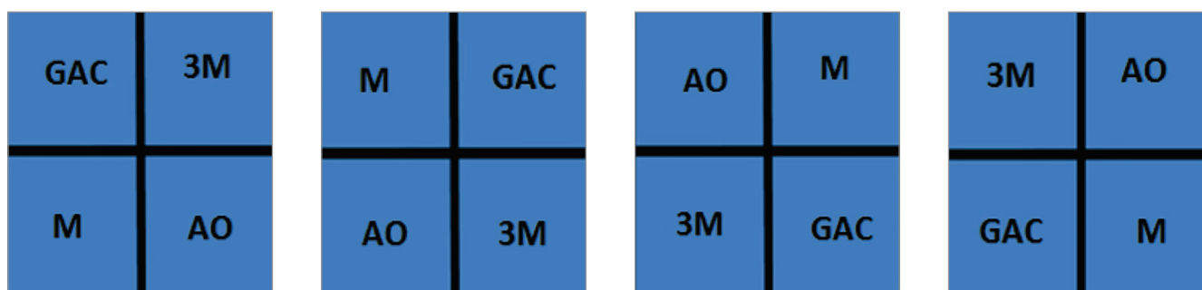
Figure 1 - Random distribution by quadrant: M = Morelli™, GAC = GAC™, AO = American Orthodontics™, 3M = 3M Unitek™.