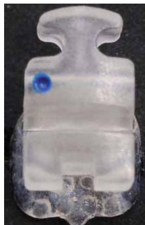
FIGURE 2 - Polycarbonate composite (plastic) bracket used in the study.