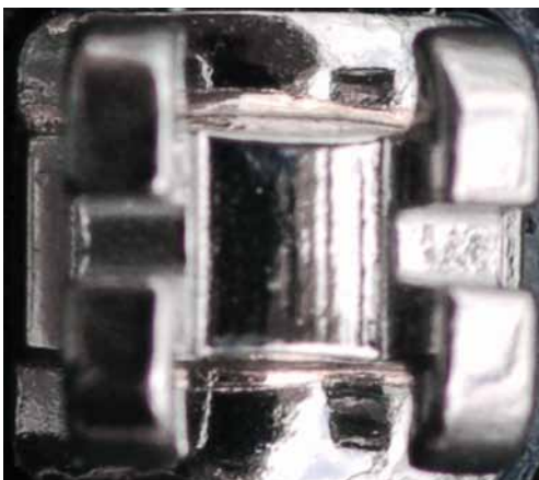
FIGURE 1 - Metal bracket used in the study.

Eight twin brackets for premolars were used; four were made of stainless steel (Fig 1) and four, of polycarbonate composite (PC) reinforced with 30% glass fiber (Fig 2), whose slots measured 0.022 x 0.030-in. The brackets were bonded with epoxy resin to a metal support and the set was placed in a universal testing machine for traction of the stainless steel wire segment with a rectangular section of 0.019 x 0.025-in, at 0.5 mm/min at a total of 8.0 mm displacement in dry medium (Fig 3).