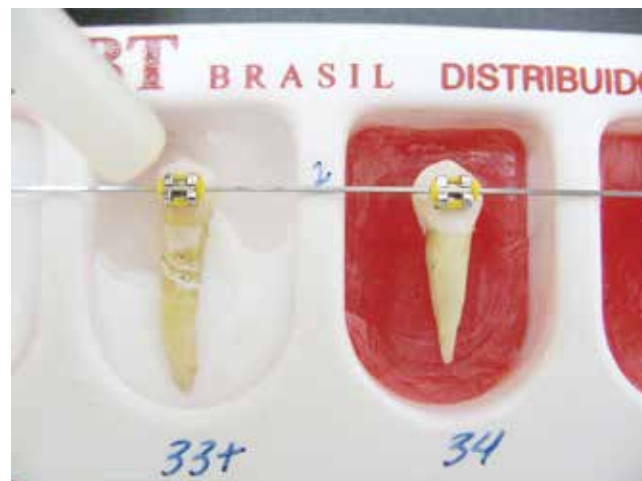
Figure 1 - Tooth / bracket set fixation to the plastic matrix.

It was intended to arrive to some conclusions from the resin resistance measurements that were made, considering five types of light curing protocols. To study the comparisons between the groups, since the measured data followed approximately normal distributions, the analysis of variance was chosen when comparing the statistical similarity of the five groups.