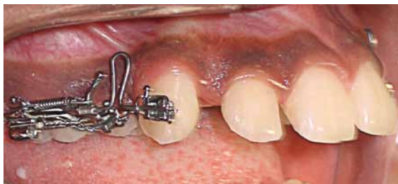
FIGURE 2 - Aspect 80 days after onset of maxillary canine retraction.