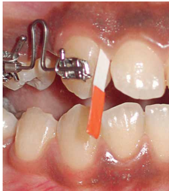
FIGURE 3 - Absorbent paper strip used for collection of gingival fluid.