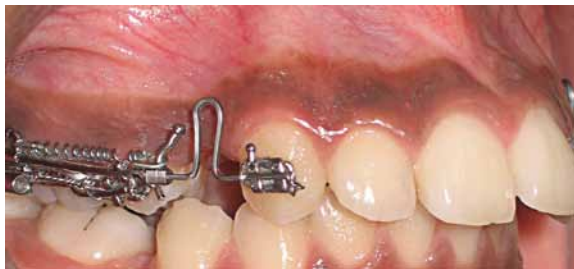
FIGURE 1 - Orthodontic device employed for maxillary canine retraction in period 0.

The collection sites were isolated using cotton rolls and air-dried. A standard absorbent paper strip (Periopaper, IDE Interstate, Amityville-NY, USA) was placed in the gingival sulcus until