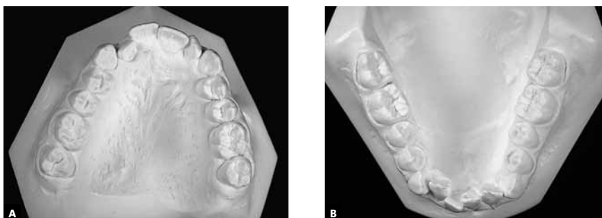
Figure 2 - A) Crowding in the upper arch in an isolated cleft palate patient. B) Crowding in the lower arch in an isolated cleft palate patient: The lower dental arch tends to accompany the upper arch, demonstrating a reduction in its transverse dimensions.