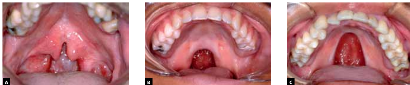
Figure 1 - A) Isolated cleft palate: Bifid uvula, B) Isolated cleft palate: Soft palate, C) Isolated cleft palate: Soft and hard palate.

The dimensions of the alveolar ridge in patients with isolated cleft palate are already reduced before the eruption of the primary teeth, regardless of the extension of the cleft, 7 and remain reduced throughout the three developmental stages of the occlusion (primary, mixed and permanent dentition). 3 Quantitative studies involving study models show that the dimensions of the dental arch in operated cleft patients are