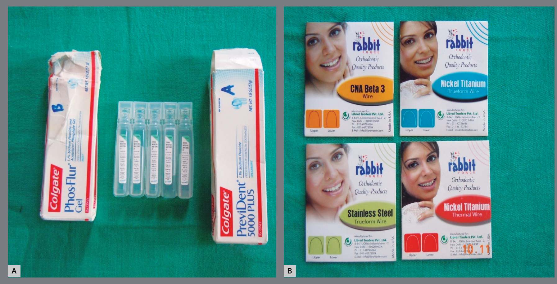
Figure 1: A) Phos-Flur gel, deionized water and PreviDent gel. B) Wires used.

The control solution used was deionized water [dH<sub>2</sub>O].