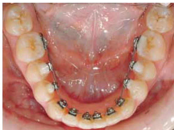
FIGURE 1 - Straight Wire lingual appliance.

To ensure patient comfort brackets should be small, with a maximum of 2 mm thickness. You don't need hooks on all teeth, only canines