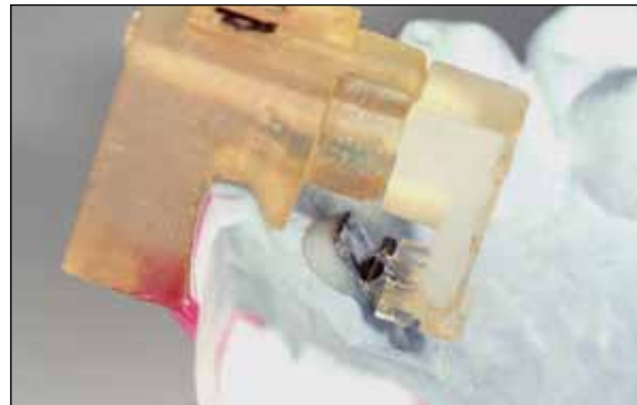
FIGURE 5 - Transfer jig on malocclusion model.

Figure 4 shows the placement of brackets on the virtual set-up and Figure 5 shows the transfer jig mounted on the malocclusion model, ready for bracket transfer to the patient's mouth.