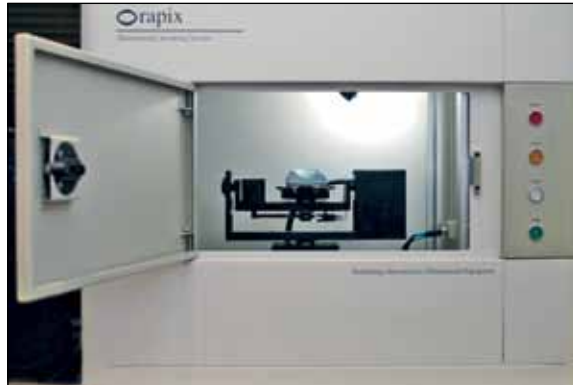
FIGURE 2 - Three-dimensional scanner.