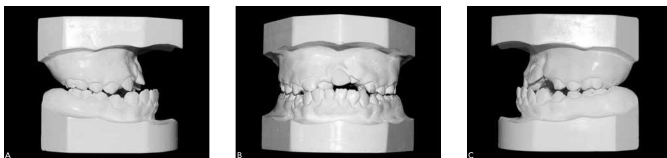
Figure 1 - Study casts of an individual from the sample used in this study, showing unilateral CLP. A) Right lateral view. B) Frontal view. C) Left lateral view.

Evaluation results were exported to a database created with SPSS software, version 13.0. Inter-examiner correlation was determined in both assessments