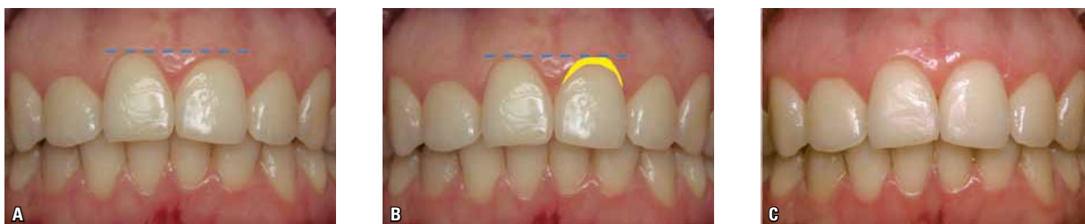
FIGURE 2 - Example of image manipulation as an auxiliary resource in planning: A) before, B) study of the gingival area to be removed in periodontal plastic surgery and C) after the surgical outcome.