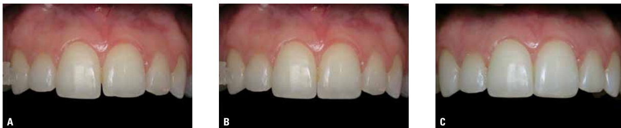
FIGURE 1 - Example of image manipulation as a resource to assist in interpersonal communication: A) before, B) manipulated image and C) after restoration with resin.