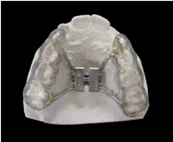
FIGURE 1 - Bonded Hyrax expander with acrylic occlusal splint used in this study.