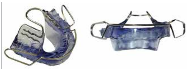
Figure 1 - Side and front view of Balters' bionator.

The descriptive data about age and time of treatment for the experimental and control groups are shown in Tables 1 and 2, respectively.