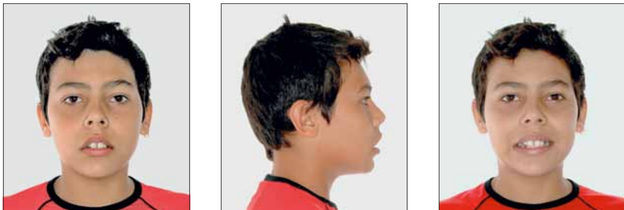
FIGURE 2 - Extraoral photographs in frontal, lateral and smiling aspects of a white individual with vertically impaired facial relationship by excess, moderate subtype.