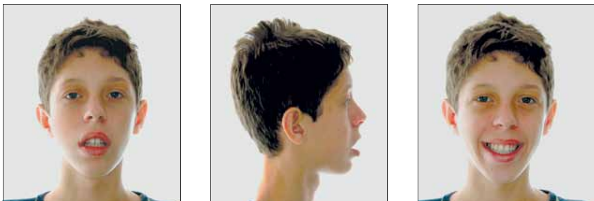
FIGURE 3 - Extraoral photographs in frontal, lateral and smiling aspects of a white individual with vertically impaired facial relationships by excess, severe subtype.