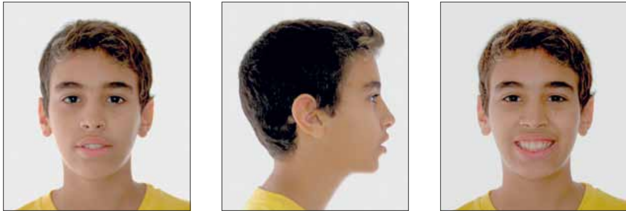
FIGURE 1 - Extraoral photographs in frontal, lateral and smiling aspects of a white individual with vertically impaired facial relationship by excess, mild subtype.