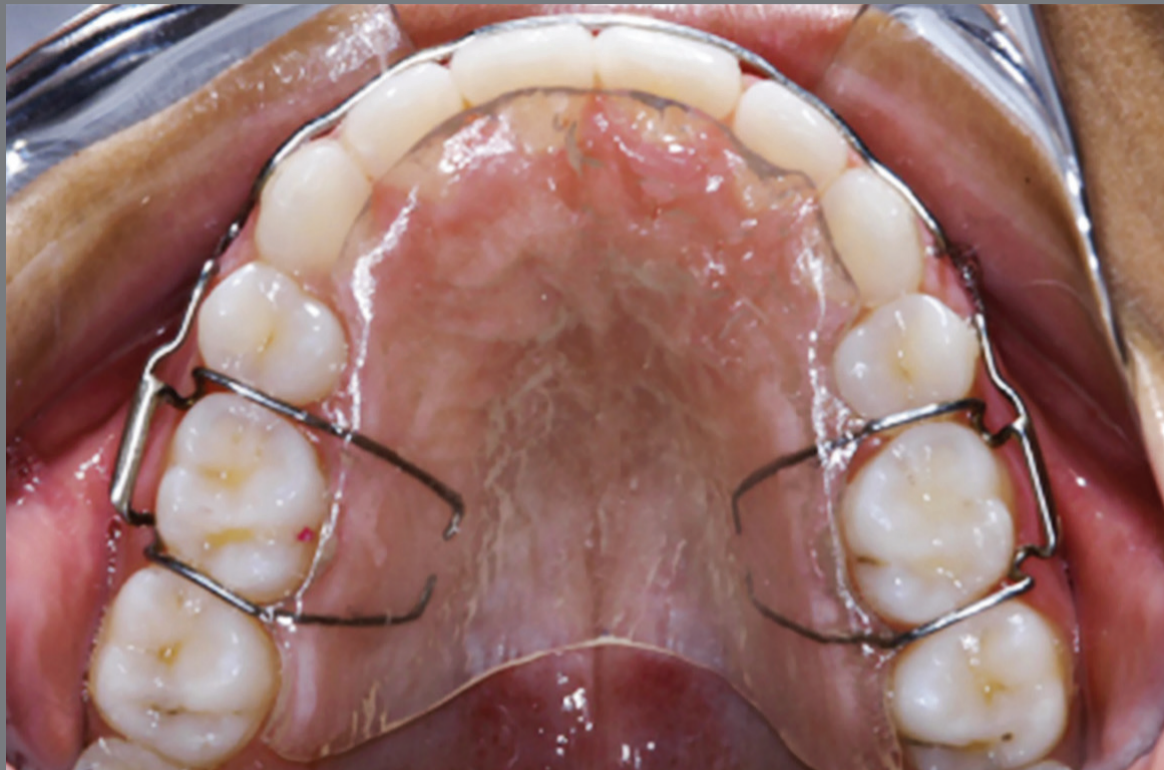
Figure 1: The modified Hawley retainer used by all patients in the sample.

Posttreatment and 1-year follow-up dental models were digitized using a 3D 3Shape R700 scanner (3Shape A/S, Copenhagen, Denmark). The following variables were evaluated using OrthoAnalyzer™ 3D software (3Shape A/S, Copenhagen, Denmark):