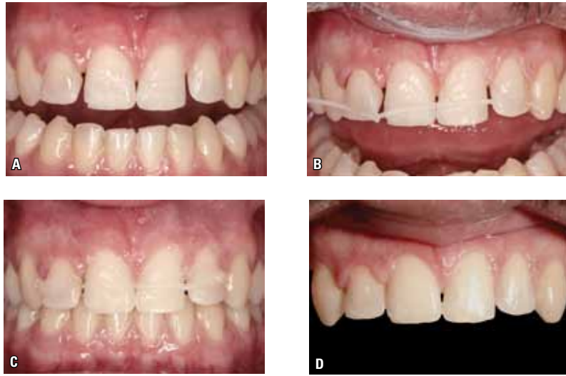
FIGURE 3 - Reopening space at the mesial of the upper lateral incisors after maxillary retainer bonding fracture (A). The retainer was still bonded to the upper canines and upper central incisors. A knot was made at the end of the solid thread (B) and this knot was bonded with composite to the labial surface of the upper left lateral incisor. The elastomeric thread was pulled and bonded to the upper right lateral incisor. The space was closed in just 10 days and the upper lateral incisors were rebonded to the upper retainer.