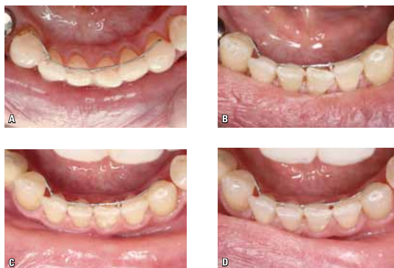
FIGURE 2 - Lower right incisor rotation after bonded retainer failure (A). The solid thread was stretched and bonded with composite just on the distal surface (B). After 10 days, a significant improvement was observed and a new thread was inserted (C). After 20 days the case was finished and the tooth was rebonded to the lower retainer (D).