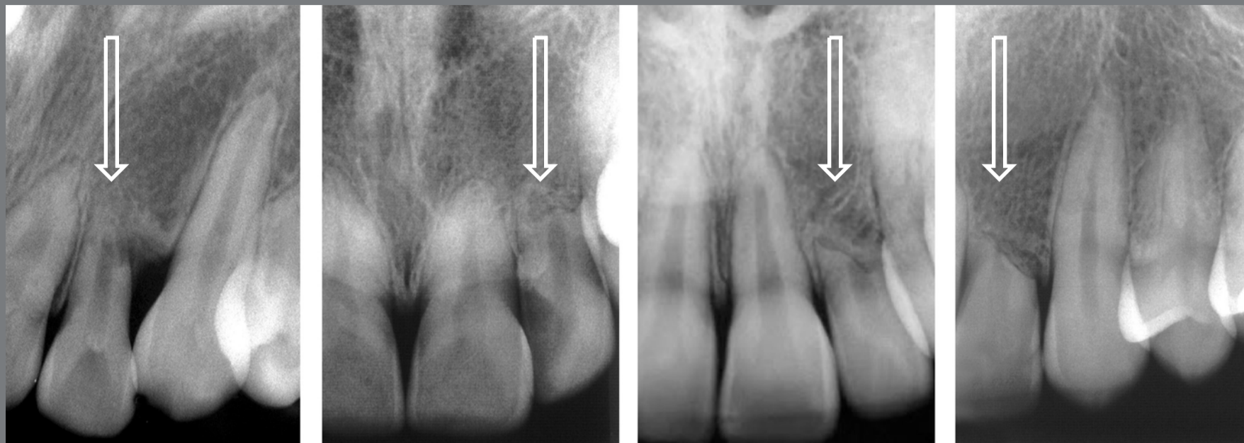
Figure 1: Four maxillary lateral incisors that have served as laterality guide for a period longer than 1 year, which would naturally and properly occur as function of the maxillary canines. The masticatory and occlusal overload induced establishment of the occlusal trauma lesion in its most advanced form, and it is characterized by inflammatory root resorption in plane (arrows). Pulp vitality is preserved.

In this situation described above, our experience with several cases has almost always led us to indicate this resorption as being part of the lesion or disease called “occlusal trauma”, with late manifestation of months and years of progression and preceded by other manifestations, which we will discuss next. Since the beginning of this “occlusal trauma” lesion, it has been caused by the chewing overload determined on the maxillary lateral incisors in this situation, when these teeth have been used as a guide for the movement of laterality, and not the canines (Figs 1 and 2).