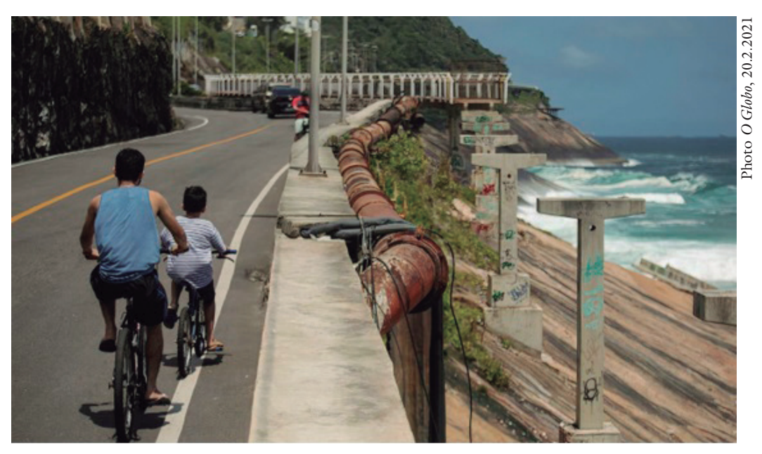
Figure 2 – Alongside debris from the bike path, users dispute the highway with automobiles.

shape it and that are simultaneously shaped by it. After all, as Ramakrishnan et. al. (2020) suggest, to think of infrastructures by considering processes of decadence, maintenance and repair allows understanding them not as self-contained forms, but as apparatuses that are permanently remade and remodeled, which produce continuous connections between things, people and power dynamics.