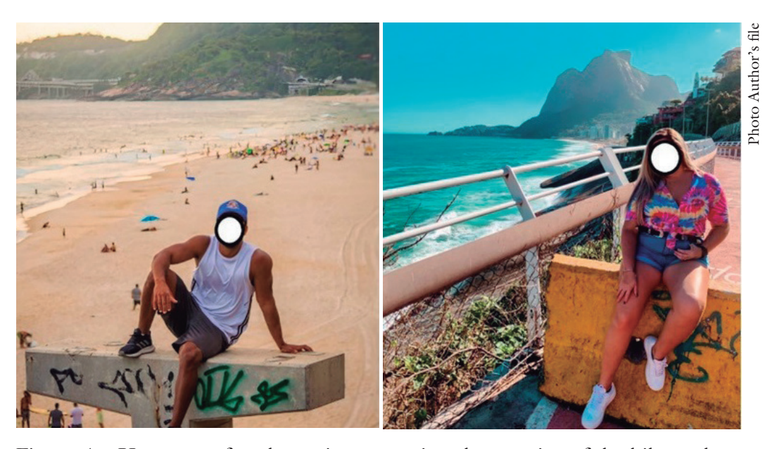
Figure 4 – Users pose for photos incorporating the remains of the bike path to the natural landscape.