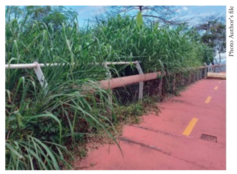
Figure 3 – Vegetation invades the bike path.

After all, through the process of degradation they gain new colors, forms, and textures, accumulating distinct marks of temporalities, such as chronological time, the time of politics and the time of public administration – which define, for example, the realization (or not) of maintenance and repair work.