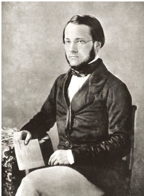
Louis Pasteur (1822-1895), French chemist and biologist, in Strasbourg, France in 1852.

We need a reserve of supplies for the Ministry of Health that allows it to pay the prices it determines and pay when it can. The Ministry does not have resources to finance production that must be initiated eight to ten months before supply, which therefore falls in the following fiscal year, and is subject to tempestuous budget approvals (officially the Ministry ordered the seasonal flu vaccine in 2008), only after it received and used the vaccine.