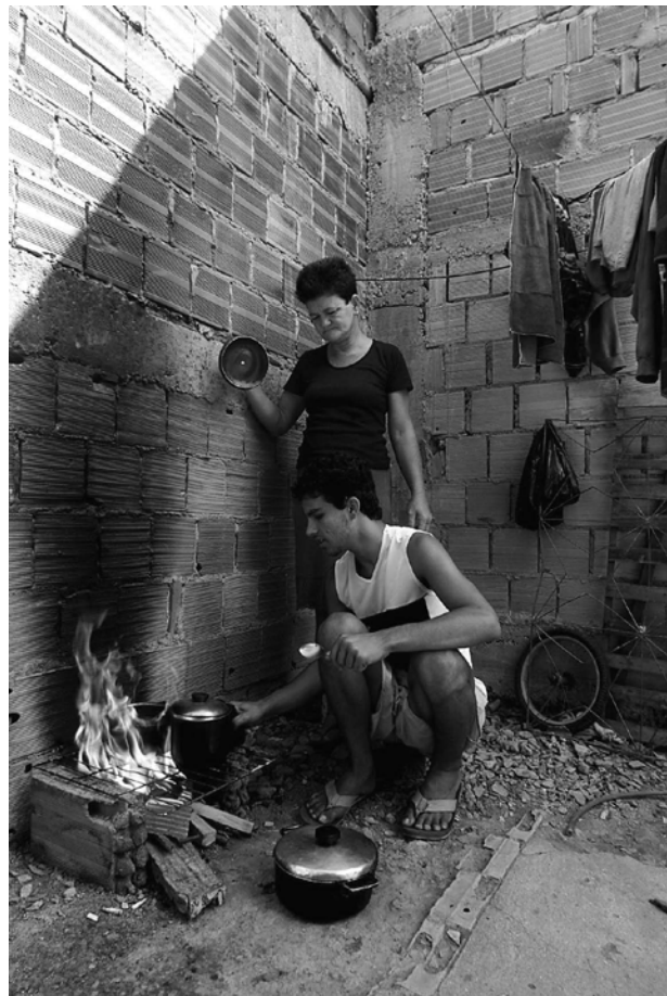
With not much money to buy gas vessels, dwellers of Duque de Caxias (RJ) cook in improvised firewood stoves.