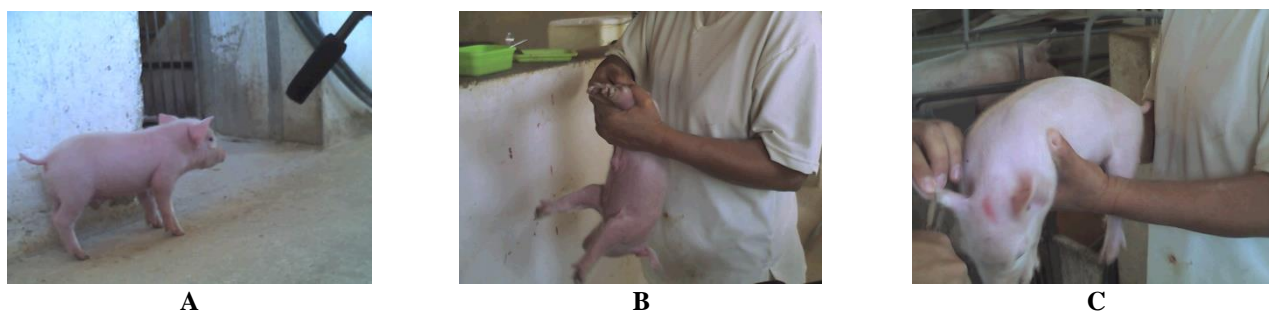
FIGURE 1. Collecting acoustic signal under standard conditions (A), marking the ear (B) and surgical castration (C).

For the pain-free scenario, the piglets were gently removed from their stalls and allocated in a corridor (Figure 1A), in which voice signal was recorded. For the extreme procedure scenarios, vocalizations recording were made during the farm management of tail trimming, marking and castration. These procedures were done in this order and without interval between them, as usual. The duration of the signal was the time the pigs vocalized during the process. The caudectomy was performed using a device for cutting with a hot iron. The castration carried out on males (Figure 1B) was done with a longitudinal incision on the scrotum to exteriorize the testicle, and then the spermatic cord was pulled out until its total rupture. After that, they were marked in the ears with notches and holes (Figure 1C).