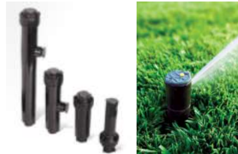
FIGURE 10. LF2400 Sprinkler Installed on RainBird Surface.