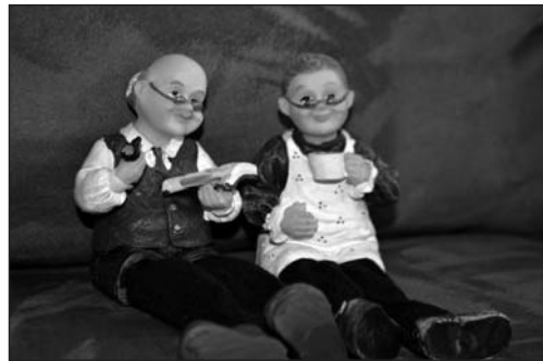
Figure 1 – Elderly Couple