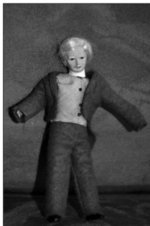
Figure 4 – Elderly-puppet

For the children, being old is to have a body marked by inscriptions where some use canes, but only some, to support themselves and stand where they are, and help them to hold on without falling down, isn't it (B., 7 years old), that is, children are aware that ageing "[...] is a natural and continuous process that begins when we are born, and from it result differences between an elderly person, an adult and a child; in the elderly person some physiological changes will take place that will be directly linked with their well-being and independence" (Ramos, 2013, p. 4).