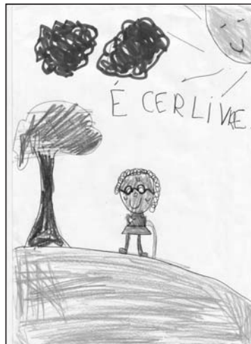
Figure 2 – Grandfather with Glasses and Cane

(drawing by B.).