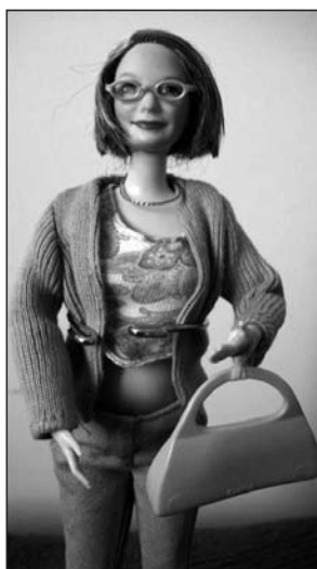
Figure 3 – Barbie’s Grandmother

older body for children is also to have a body slightly out of shape, some become chubby, have wrinkles that show that he or she is older than the others (B., 7 years old). And when one of the children looked carefully at the body of the elderly-puppets, she said: a wrinkle is a shorter skin; the skin is floppy, softer, kind of flabby (G., 6 years old). They reaffirm what Goellner (2012) teaches: “the body results from a cultural construction upon which different marks are conferred at different times, places, economic circumstances, social, ethnic and generational groups [...]”, (Goellner, 2012, p. 106). For the group of children studied here, there are generational marks that deal with color, skin, elasticity, and flabbiness characteristic of an age. By acting upon the puppets, children show us in their dictums how much our body is not fixed, static, but how much it is changeable, provisory, being capable of constantly adapting to the interventions present in each culture, to its laws, representations, and also to the discourses that are built around them. By looking at the body of a puppet, a child may realize that this one is chubby; this one has grey hair and moustache. This one has glasses and is skinny, I think it is nice to be old (F., 7 years old).