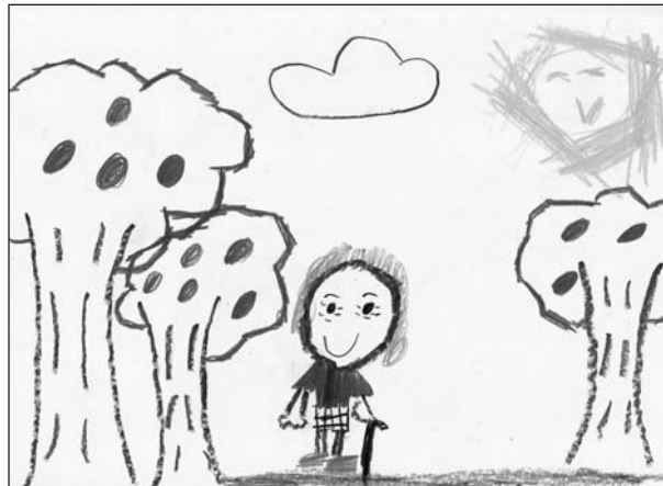
Figure 5 – My Grandfather with his Cane in Redenção Park

(drawing by B.)