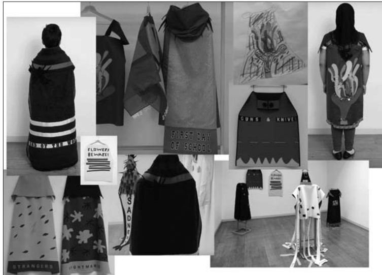
Image 1 – Pieces of the video for dissemination of The Name of Fear , an exhibition by the artist Rivane Neuenschwander