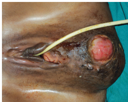
Figure 1. Pre-operative appearance. Large mass located in perineal and vulvar region

Gynecological examination showed a large mass located in the groin and vulvar region that caused a decrease of vaginal cavity and bulging on its posterior wall (Figure 1).