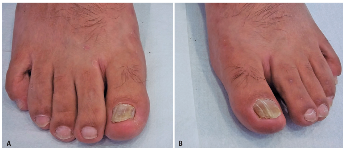
Figure 1. A and B) Distal lateral subungual onychomycosis of the right and left hallux

Morphologically similar species were distinguished using molecular techniques and MALDI-TOF mass spectrometry, which initially identified the agent as Cladosporium endophytica and Cladosporium sphaerospermum , respectively. Re-identification was performed via sequencing of the ITS1 (5'-TCCGTAGGTGAACCTGCGG-3') and ITS4