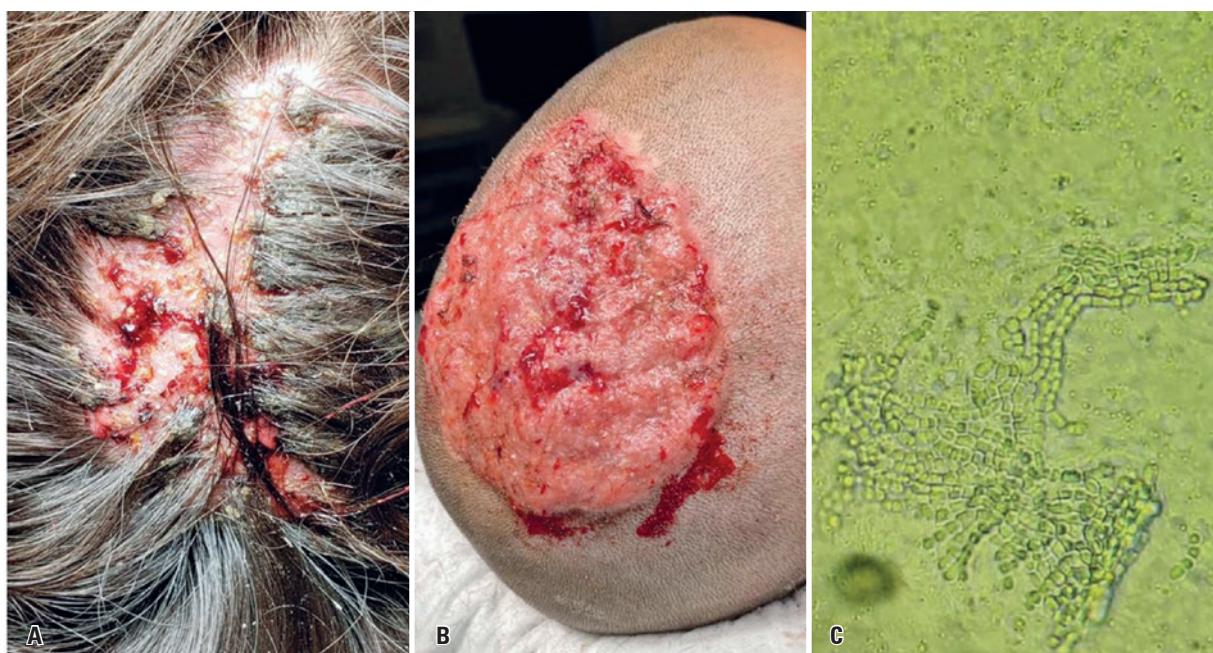
Figure 1. (A) Scalp lesion seen upon initial assessment in the emergency department; (B) Scalp lesion after surgical wound debridement; (C) Dermatophyte detected on direct examination

Final anatomopathological results (November 24, 2019) revealed acute dermatitis and cellulitis associated with fungal infection. Fungal spores and other fungal structures were seen in follicular infundibulae and in the superficial cornified layer. These were positive for the fungal cell wall stains periodic acid schiff (PAS) and Grocott methenamine silver. Neutrophilic exocytosis in the superficial epidermis, rarefaction of sebaceous glands with destruction of the deep portion of hair follicles, severe diffuse neutrophilic inflammatory infiltrate in the reticular dermis and subcutaneous tissue, tissue necrosis and phagocytosis of cell debris by sparse multinucleated histiocytes were also observed.