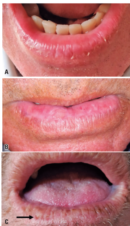
Figure 2. Clinical features observed in actinic cheilitis. A) Mild actinic cheilitis characterized by scaling, dryness, and mild edema in the lower lip; B) Moderate actinic cheilitis showing fissures, areas of leukoplakia and erythema, and more pronounced edema and scaling; C) Severe actinic cheilitis. Note the presence of atrophy, fissures, crusts, and pale and/or brownish spots in the lower lip

Regarding the risk factors associated with the development of AC, the results of bivariate analysis are shown in table 2. There was a trend towards an