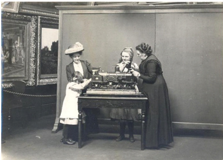
FIGURE 5 - TWO BLIND GIRLS BEING SHOWN A MODEL LOCOMOTIVE BY SIGHTED GUIDES