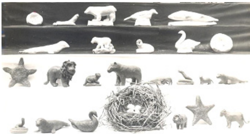
FIGURE 7 - MODELS MADE BY BLIND CHILDREN