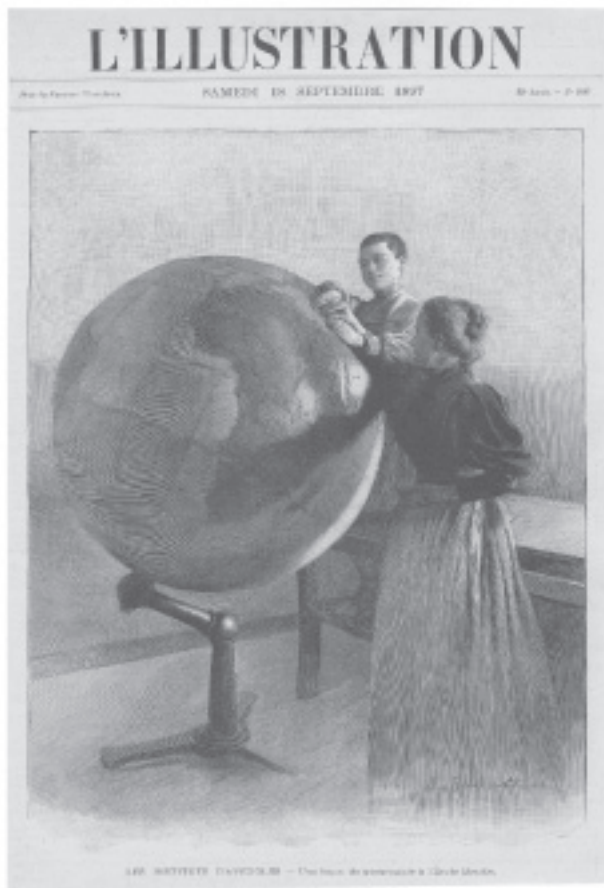
FIGURE 6 - 'UN LEÇON DE GÉOGRAPHIE À L'ÉCOLE BRAILLE', L'ILLUSTRATION, SAMEDI 18 SEPTEMBRE, 1897

case', it had 'convenient receptacles for carbonised or ordinary paper' and the guidance lines 'are made of wires placed on springs, which easily give way on the slightest pressure, and thus enable the writer to form the lower portion of the letters g, y etc.' The report points to such apparatus also being on display at the Great Exhibition of the Works of Industry of all Nations, London 1851 and also at the London International Exhibition on Art and Industry of 1862 (JOHNSON, 1871).