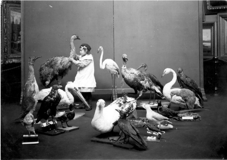
FIGURE 2 - A BLIND GIRL EXAMINING MOUNTED BIRDS