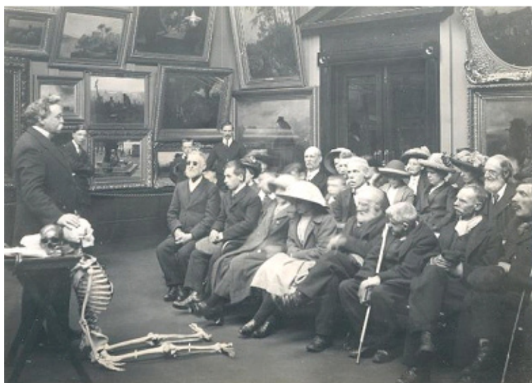
FIGURE 1 - BLIND ADULTS LISTENING TO A SHORT LECTURE AT SUNDERLAND MUSEUM BEFORE EXAMINING A HUMAN SKELETON, 1913.