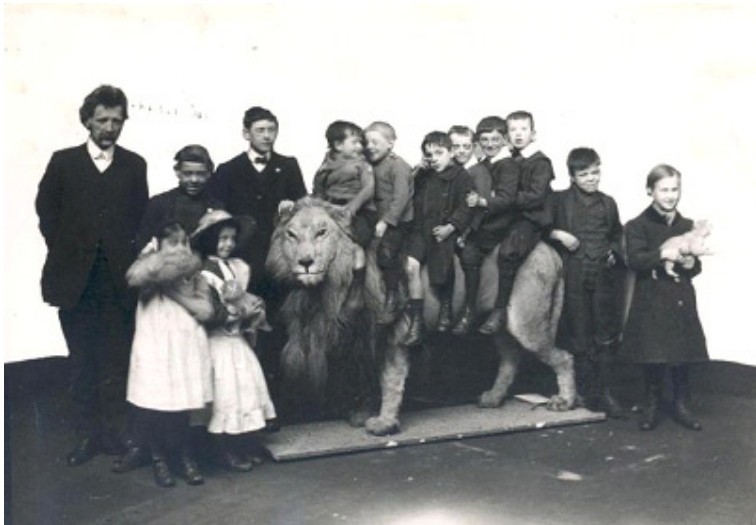
FIGURE 4 - A GROUP OF BLIND CHILDREN FROM SUNDERLAND COUNCIL SCHOOL SITTING ON WALLACE THE LION TO APPRECIATE THE SIZE OF ANIMALS