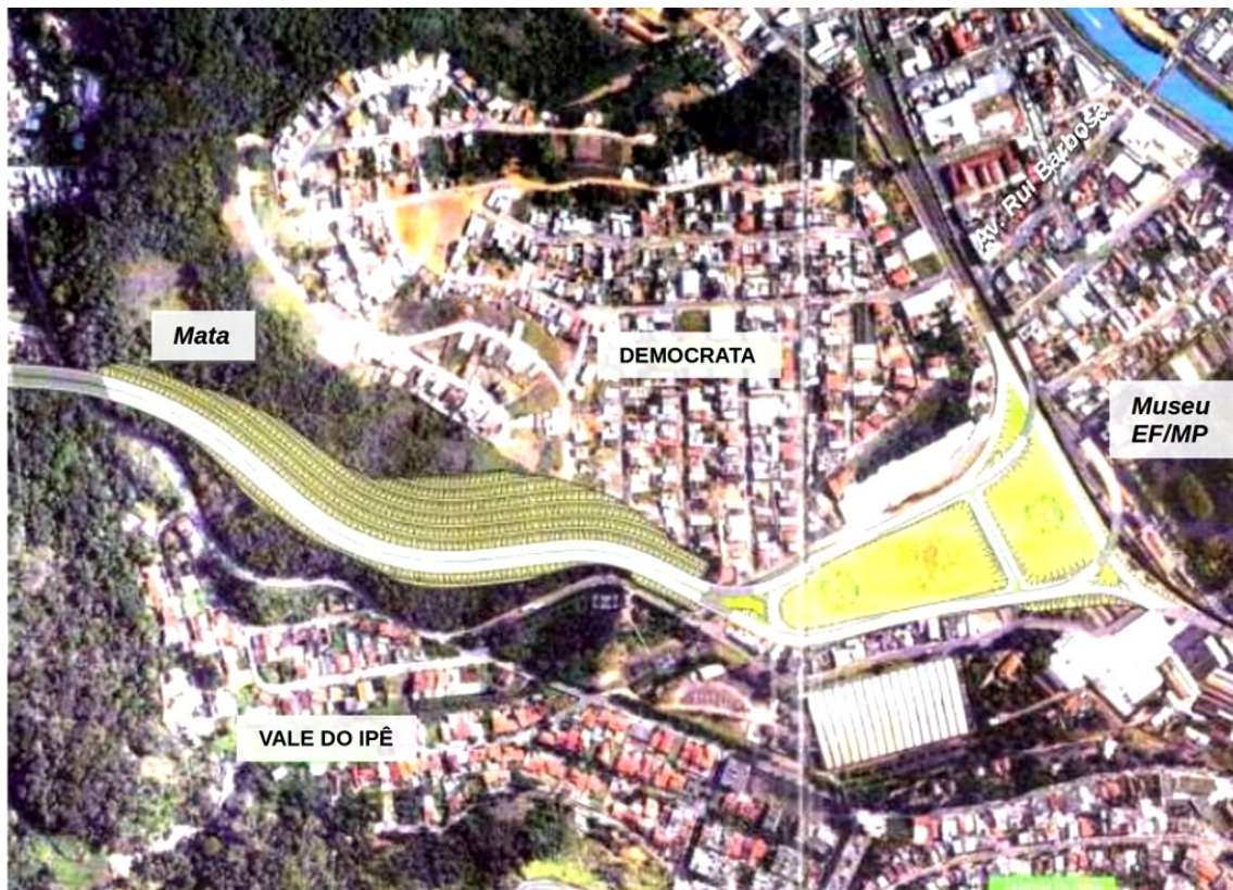
Image Letter 2- Forest, Railway Station (EF/MP) and Mariano Procópio Museum Park