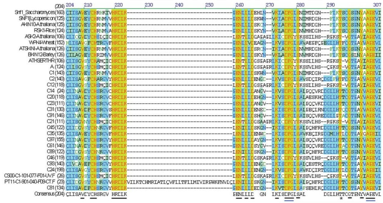
Figure 1 - Alignment of part of the N-terminal catalytic domain and the T-loop domain of CitEST contigs and singletons encoding putative SnRKs, SNF1 and other SnRKs. Accession numbers are as follows: SNF1 - Saccharomyces cerevisiae (M13971); SNF1 - Lycopersicon esculentum (AAF66639); AKIN10 - A. thaliana (M93023); RSK1 - Rice (U55768); ASK2 - A. thaliana (Z12120); WPK4 - Wheat (D21204); ATSKINI - A. thaliana (X94755); B4N12 - Barley (X65606); ATHSERTHR (M91548); and A ( A. thaliana ) (S71172). Amino acids highlighted in yellow are identical in all the proteins. Blue represents consensus residues derived from a block of similar residues; green represents consensus residues derived from the occurrence of more than 50% of a single residue at a given position. The conserved T-loop domain is underlined in red. The DFG and APE conserved T-loop boundary consensi are underlined in blue. The putative phosphorylated threonine is indicated by asterisk (*).

family might be specific for grasses. This statement is in agreement with Harford and Hardie (1998) where the SnRK1b subfamily is present in rice, oat, rye and barley.