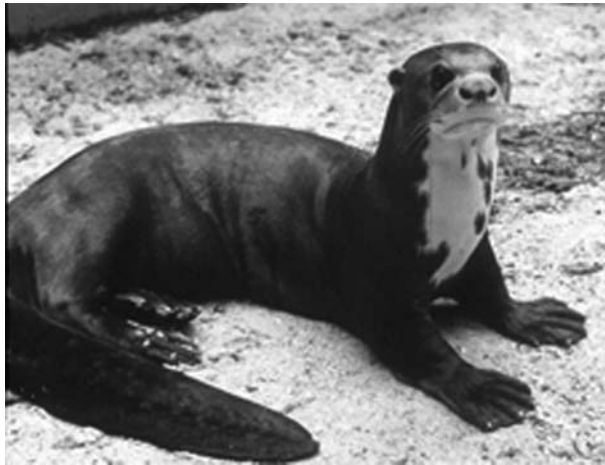
Figure 1 - Amazonian giant otter ( Pteronura brasiliensis ) held in captivity at the Aquatic Mammals Laboratory of the Brazilian National Institute for Amazonian Research (Instituto Nacional de Pesquisas da Amazônia, INPA), Manaus, Amazonas (AM), Brazil.

blood samples collected from the femoral vein using a heparinized syringe which was maintained in a vertical position for 30 min after collection to allow the lymphocytes to separate. After separation, the lymphocyte layer was added to Complete Medium for Karyotyping (Cultilab, Campinas, SP) and the cultures incubated for 72 h at 37 °C. One hour before the end of incubation, 0.3 mL of colchicine at 0.0125% (w/v) was added. The cells were harvested by centrifugation at 1000 rpm for 10 min and 10 mL of hypotonic 0.075 M KCl solution at 37 °C was progressively added in 2 mL aliquots at 10 min intervals, after which the cells were fixed using four changes of Carnoy fluid (methanol/acetic acid 3:1 v/v). The methodology was modified from the protocol described by Verma and Babu (1995). Constitutive heterochromatin was detected using C-banding (Sumner, 1972) and the nucleolar organizer regions (NORs) by silver nitrate staining (Ag-NORs) as described by Howell and Black (1980). The chromosomes were identified by the arm ratio criteria (Levan et al. , 1964) where the metacentric (M), submetacentric (SM) and subtelocentric (ST) were considered as bi-armed chromosomes and the acrocentric (A) as one-armed chromosomes. In each group, the chromosomes were arranged in order of decreasing size.