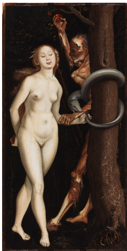
Figure 1 - Eve, the Serpent, and Death.

The National Gallery of Canada, in Ottawa, houses a sinister painting by German Renaissance artist Hans Baldung Grien (1484-1545), Albrecht Dürer's most celebrated student. The 64cm x 325cm oil on panel, known as "Eve, the Serpent and Death" (Fig. 1), depicts those three figures against an ominous shadowy background. Eve has been made the primary focal point since, unlike the other two darker figures, her body is flooded in light and fully exhibited. Contrary to the usual employment of luminosity to suggest sanctity in religious art, here light is used to emphasize Eve's brazen sexuality. Her facial expressions are lustful, her genitals are not covered by the customary vegetation, her left hand is holding the serpent's tail, while the fatidic fruit is half-hidden in the right one, suggesting that she is conscious of the transgressive nature of her actions. Adam is characterized as Death itself. His body is in an advanced state of disintegration, his rotten left hand is reaching for Eve at the same time that it is being bitten by what A. Kent Hieatt (1983) has described as a weasel-faced serpent. This perverse cat's cradle game has puzzled critics for centuries and, for Hieatt (1983, p. 299), Eve can be seen here "exercising a sexual temptation upon Adam [...]. With devious slyness, she extends her hand towards the serpent's tail, representing both Adam's sexual member and Satan."