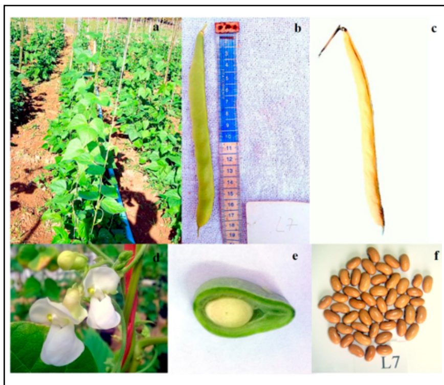
Figure 1. Morphological traits of the cultivar “UENF Goytacá”. a) experimental field; b) immature pod (green color, 15 to 20 cm mean length, slight curvature degree); c) dry pod; d) flower; e) seed section shape; f) seed (shape, color, and brightness). Campos dos Goytacazes, UENF, 2017.

emergence, the plants were tutored with bamboo, on crossed fence and wire. Irrigation was by sprinkling method twice a day turn.