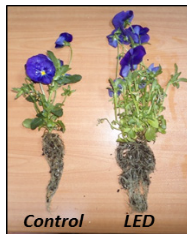
Figure 2. Blue Blotch pansy ( Viola cornuta ) plants grown under low plastic tunnels without additional lighting (control group) and with five hours of supplemental LED lighting {plantas de Viola cornuta cultivadas sob tunel plástico sem (testemunha) e com iluminação adicional por iluminação LED}. Turkey, Cukurova University, 2010.

There are significant effects of the different wavelengths of light source on the physiology and growth of plants. Red-orange light (600-700 nm wavelength) is effective on the increase in leaf area and biomass (Johkan et al. , 2012); blue light has an effect on the hypocotyl elongation and biomass (Johkan et al. , 2010, 2012) and green light is effective on the leaf development and stem elongation (Folta, 2004; Kim et al. , 2004). In recent years, due to its advantages, the use of LED lamps in