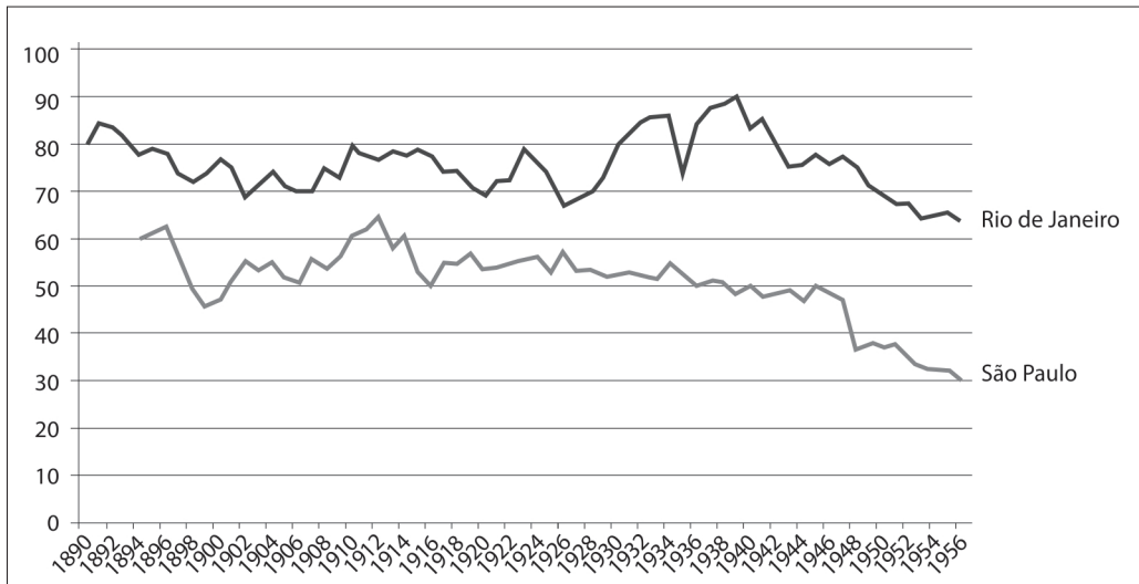
Chart 1 – Stillbirth rate per 1,000 total births, Rio de Janeiro and São Paulo, 1890-1956