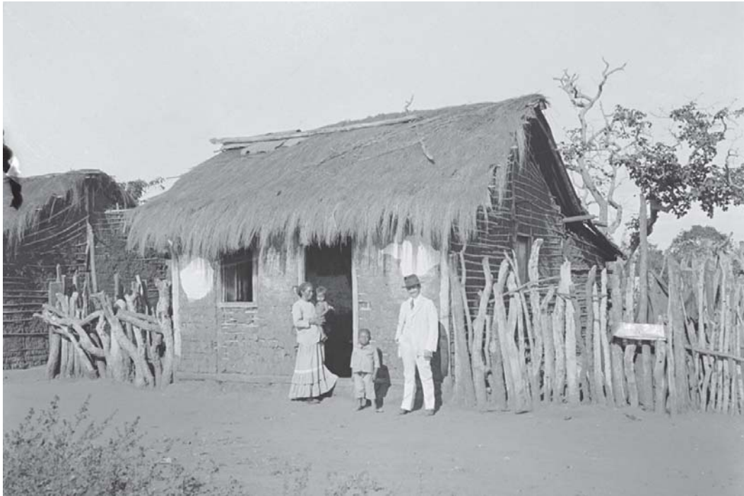
Figure 3 : “Chaumières à triatomas. Environs de Lassance (Brésil)” (Brumpt, 1914). This is one of the photographs taken by Brumpt in Lassance illustrating the kind of housing where triatomas proliferated