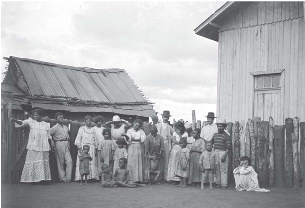
Figure 4: Photograph entitled “Chagas with a group of patients. Lassance”, taken by Brumpt in 1914. Actually, the man in the picture was not Chagas