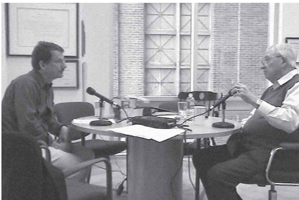
Figure 1: Interview with Donald A. Henderson (right), conducted by Gilberto Hochman. Baltimore, Nov. 11, 2008

Doctor Candau was furious because he felt that the announced contribution of the United States had been significant in persuading the Assembly to launch the program. I must note parenthetically, however, that the Soviet Union had actively promoted global smallpox eradication for a number of years but Candau felt that the U.S. was more to blame for what he considered to be a regrettable policy. He said: “I want an American to run the global program so that when it fails, it will be seen that the U.S. bore much of the responsibility.” I was called to the office of the Surgeon General in Washington, and [he] said: “You’re going to be assigned now to Geneva.” And I said: “No, we’ve just started this West Africa program. I’ve got too much to do, I can’t possibly go. Besides which there’s very little money available in the WHO budget – $2.4 million.” This was not enough even