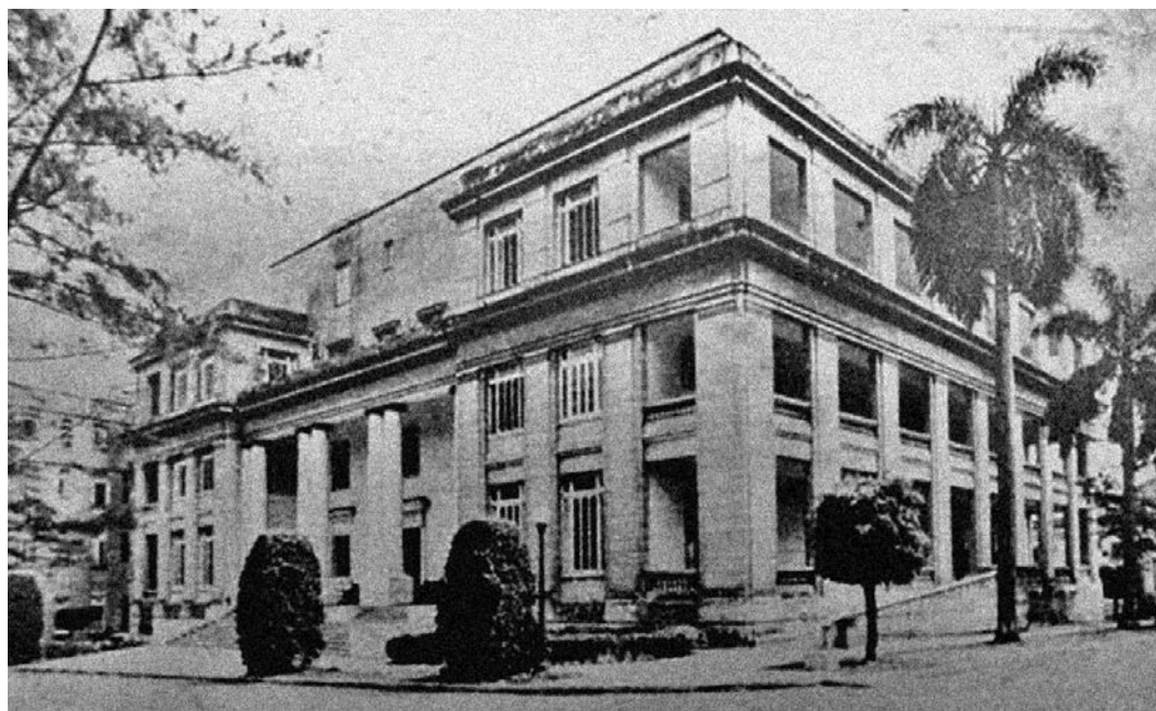
Figura 5: View of the casa de salud La Purísima Concepción of Havana's Asociación de Dependientes del Comercio, unknown date

integralism, or subscribing to anarchism or separatism. The rich merchants opposed the CADC because of the “greater freedom to which those who supported that Association would necessarily aspire” (Lahullier, 2006, p.177), while anarchists criticized the associations for pursuing “social containment” (Casanovas, 1998, p.208).